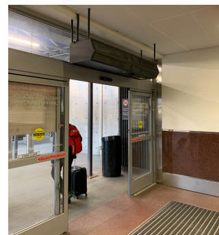
Application Images: Above - Distribution Warehouse Floor Plan; Top Right - Airport Customer Entrance; Middle Right - Terminal Gate; Bottom Right - Airport Customer Entrance