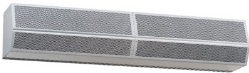
EP2 (Extra Power)