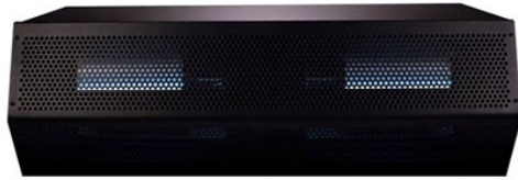
Clean Air (UVC)