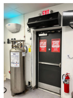
Application Images: Above - Fast Food Restaurant Floor Plan; Top Right - Drive-Thru Application; Middle Right - Indoor/Outdoor Dining; Bottom Right - Receiving Door