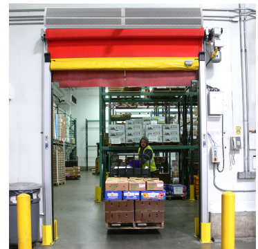
Application Images: Above - Distribution Warehouse Floor Plan; Top Right - Cold Storage Walk-In Fridge; Middle Right - Walk-In Cooler Corridor; Bottom Right - Cold Storage Dock Door