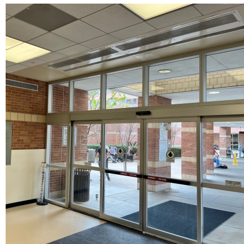
Application Images: Above - Hospital Floor Plan; Top Right - Hospital Reception Area; Bottom Right - Customer Entrance