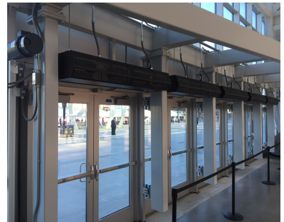
Application Images: Sports Arena Entrance