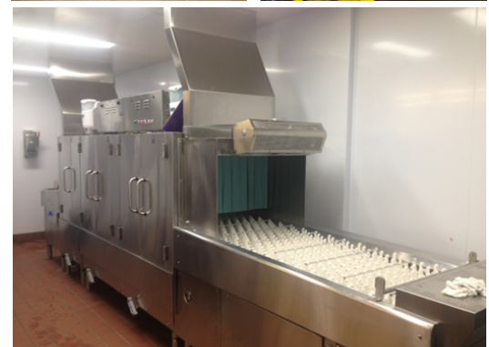
Application Images: Above - Distribution Warehouse Floor Plan; Top Right - Dock Door with Vertical Mount; Top Center - Customer-Finish Bronze-Coated Air Curtain; Bottom Right - Dishwasher Dryer