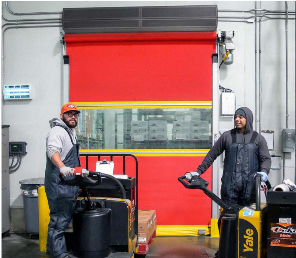
High-speed doors in cold storage realize better temperature-loss protection when amplified with Mars protective barrier