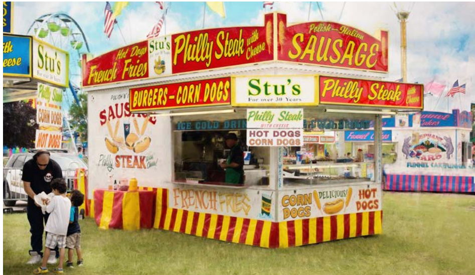
No matter how large or small, Mars strong protection works safely 24/7