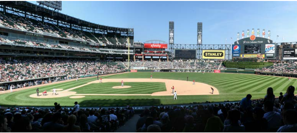
Keep the action going with Mars providing safe, barrier-free sanitation and protection