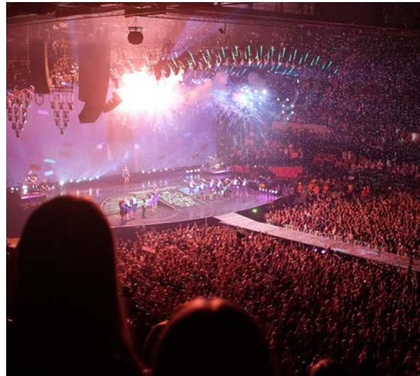
No space is too large or openings too large for Mars protection