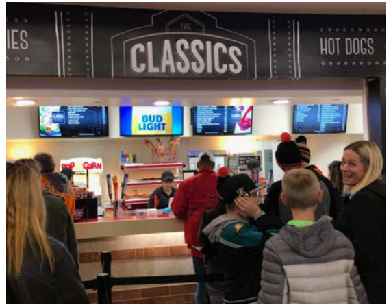
Food prep areas and food concessions require amplified sanitation for health department regulations and guest comfort.