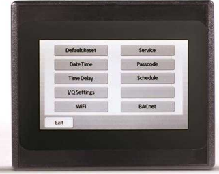
EASY TO MANEUVER TO KEY FUNCTIONS

For over 50 years, Mars Air Systems has been the international leader with air curtains. Manufacturing products of the highest reliability that can fit a range of applications and sizes; from drive-thru windows to receiving doors to outdoor patios, we help you comply with federal and state regulations while we lower energy costs and protect climatized air.