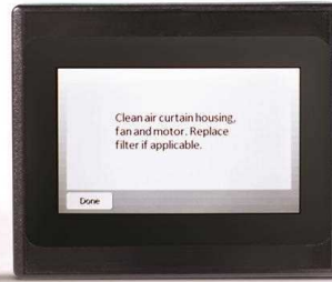
SERVICE TASKS CLEARLY NOTED