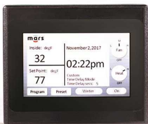
MAIN SCREEN NOTES TIME AND TEMPERATURE