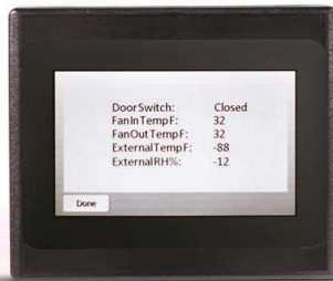
KEY TEMPERATURES DISPLAY IN EASY-TO-READ SCREEN